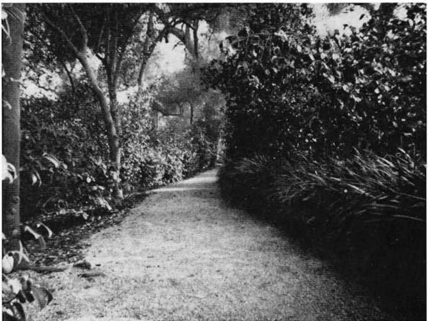
The Huntington Botanical Gardens have the largest and best collection of camellias to be found anywhere.