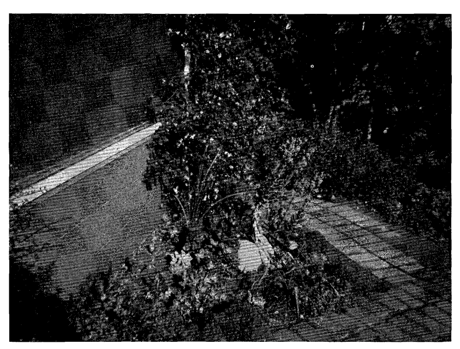
A little corner of the garden can be used for succulents.